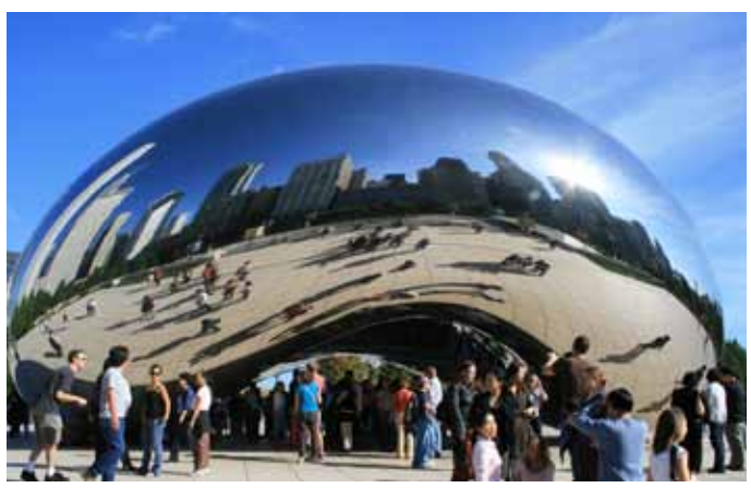
Cloud Gate Sculpture in Millennium Park

June is the perfect time to experience Chicago's beautiful parks and lakefront, its remarkable architecture, world-class museums, Michigan Avenue shopping, and its legendary blues scene. The Chicago Marriott Downtown Magnificent Mile, located on Michigan Avenue and Rush Street, gives you easy access to all the popular attractions. A train stop is located just 2 blocks from the Marriott on Grand and State Streets. This is part of Chicago's network of buses and trains called the "L" (for elevated). Tuesday will be a free afternoon for attendees this year to allow you to spend time exploring this great and very walkable city.