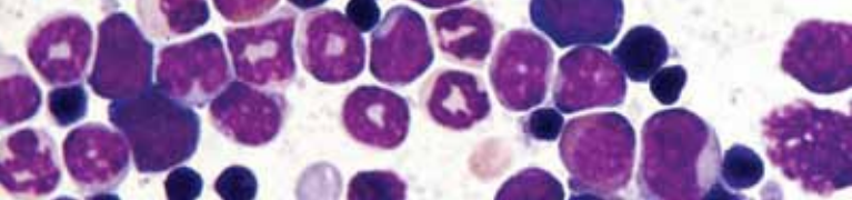
Cell image

Visit the STP Web site at www.toxpath.org