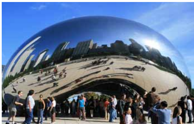
Cloud Gate Sculpture in Millennium Park

June is the perfect time to experience Chicago's beautiful parks and lakefront, its remarkable architecture, world-class museums, Michigan Avenue shopping, and its legendary blues scene. The Chicago Marriott Downtown Magnificent Mile, located on Michigan Avenue and Rush Street, gives you easy access to all the popular attractions. A train stop is located just 2 blocks from the Marriott on Grand and State Streets. This is part of Chicago's network of buses and trains called the "L" (for elevated). Tuesday will be a free afternoon for attendees this year to allow you to spend time exploring this great and very walkable city.