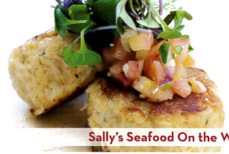
Sally's Seafood On the Water